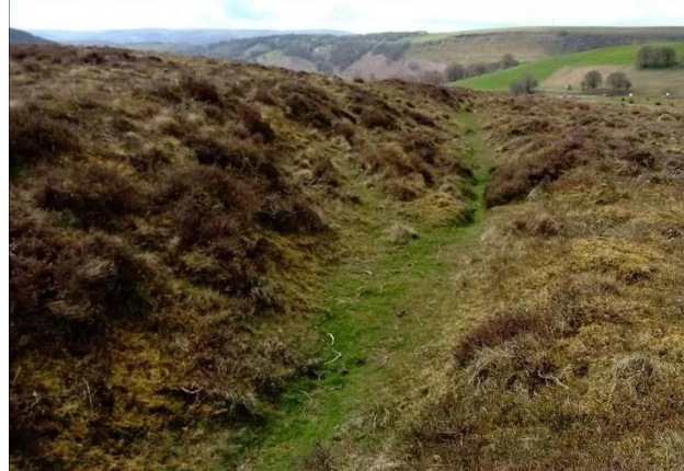
Photograph 10.3: Example of a dry drainage ditch orientation NE-SW