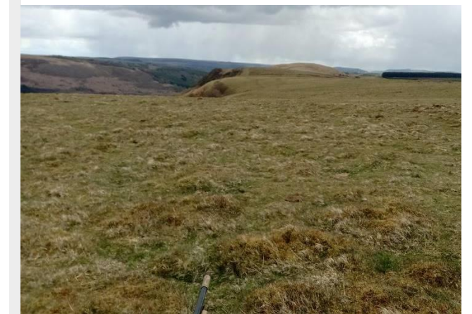
Photograph 10.2: Flat elevated ridge

10.3.4 Hydrologically the site lies within the catchments of Ebbw Fawr River and the Sirhowy River. Both Rivers flow south through urban areas and forestry before merging at Aberbeeg eventually flowing into the River Usk and River Severn/Bristol Channel. Although there are no named watercourses within the site boundary but are a number of mapped drains. The drains varied in dimensions but were general 1 m - 1.5 m wide and 0.5 m - 1 m depth and were generally dry. At the time of the site visit despite there being light rainfall there was no flowing water within the drains as shown on Photograph 10.1 and Photograph 10.2.