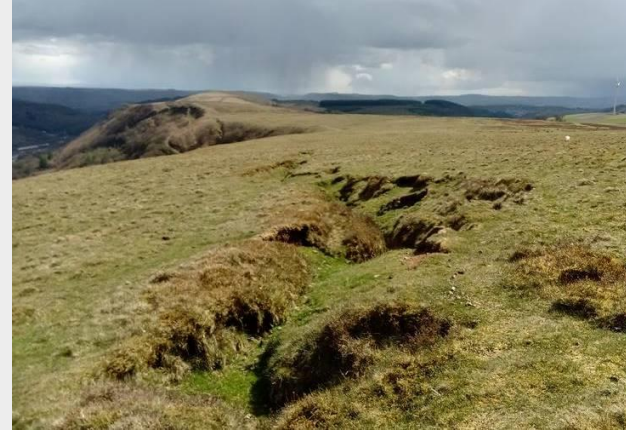
Photograph 10.4: Wide ditch running south at Photograph taken at National Grid Reference (NGR) (SO 16725 06799)