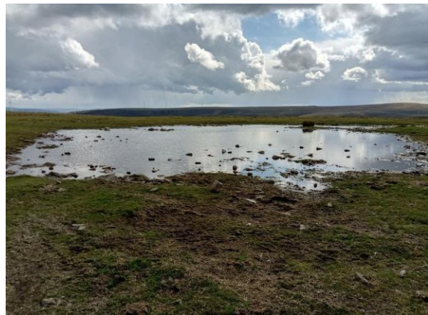
Photograph 10.5: Mapped pond within the site boundary at NGR (SO 16372 07249)