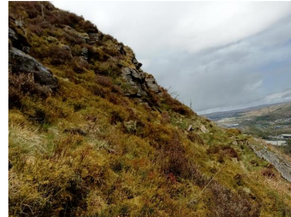
Photograph 10.7: Steep crag