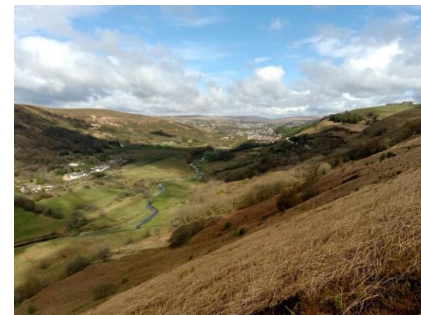
Photograph 10.1: View from ridge to valley and Sirhowy River

10.3.3 The proposed development would be situated on an elevated flat ridgeline, with steep slopes to the east and west down to the valleys on either side. The lowest elevation is in the south west corner. There are areas of made ground and exposed rock. Being situated on a ridgeline there are no mapped or named watercourses within Manmoel site boundary.