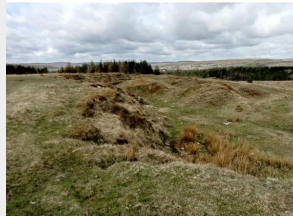
Photograph 10.6: Example of hummocky made ground NGR (SO 15877 08919)